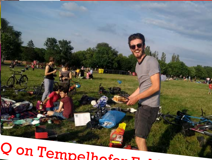
Summer BBQ on Tempelhofer Feld 06/2019