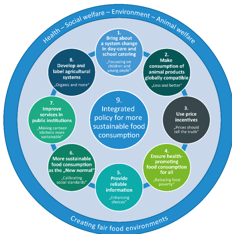
Figure: Nine key recommendations for an integrated policy for more sustainable food consumption