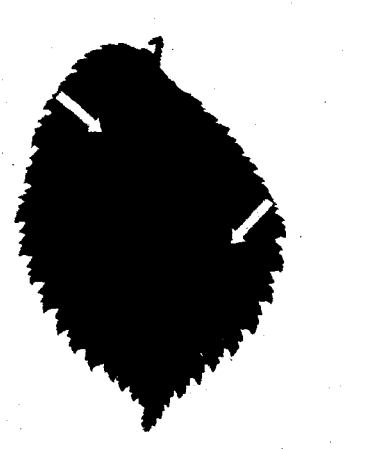
Figure 2. Elm leaf with chlorotic ringspots (arrow left) and chlorotic patterns along the veins (arrow right).

duced by Elm mottle virus were observed previously in Great Britain and Germany (Jones and Mayo, 1973; Schmelzer et al. , 1966). Ford et al. (1972) described Cherry leaf roll virus -infected Ulmus americana L. as exhibiting chlorotic ringspots, mosaic, leaf deformations and enations. However, all symptomatic U. lae vis Pall trees from Caputh tested negative in ELISA or electron microscopy for Cherry leaf roll virus and Elm mosaic virus . There is a single report of virus-infection of U. laevis Pall. by Tomato bushy stunt virus (TBSV) (Novak and Lanzova, 1980). Symptomatic elm trees from Caputh were negative for TBSV in ELISA.