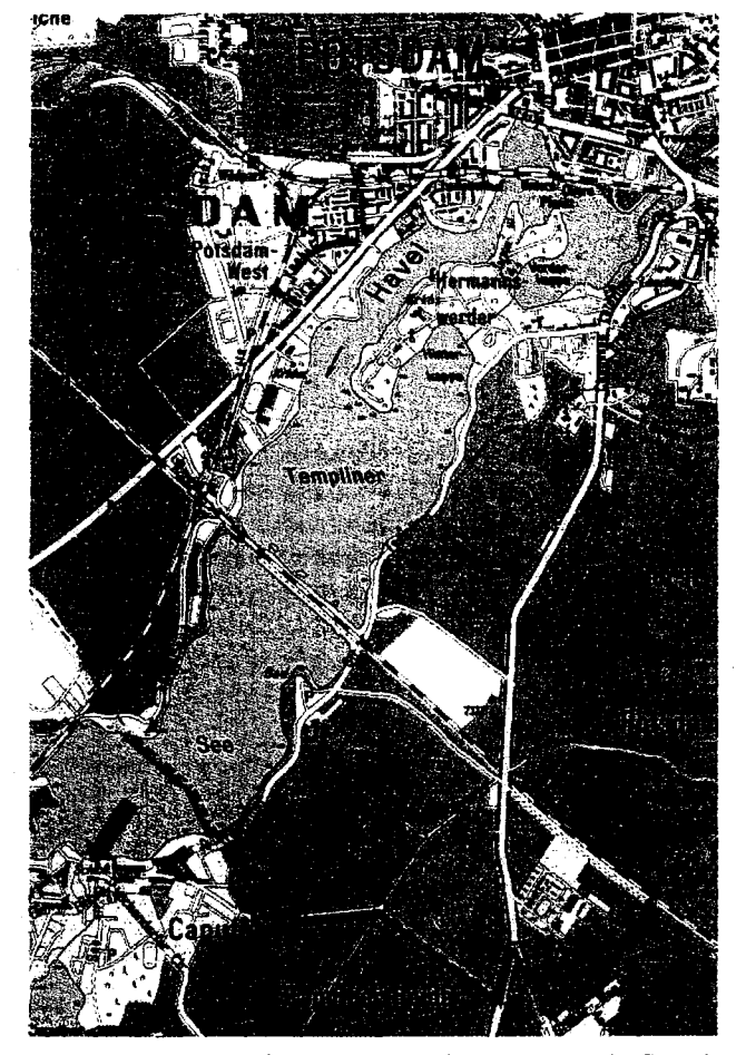
Figure 1. Location of samples. Samples were taken in Caputh (arrow), southwest of Potsdam in the northeast of Germany.

Double-antibody sandwich enzyme-linked-immunosorbent assay (DAS-ELISA) was performed accor-