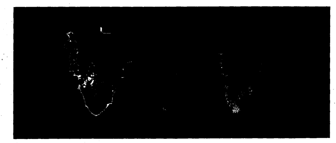
Figure 3. Leaves of Chenopodium sp. showing characteristic symptoms after mechanical inoculation with crude extracts of diseased elm leaves. C. quinoa showing chlorotic local lesions (left); C. album showing chlorotic lesions (middle); C. amaranticolor showing red ringspots (right).

No symptoms (-). Chlorotic local lesions (CCL). Red ringspots (RR). Not tested (nt); virus particles (+).