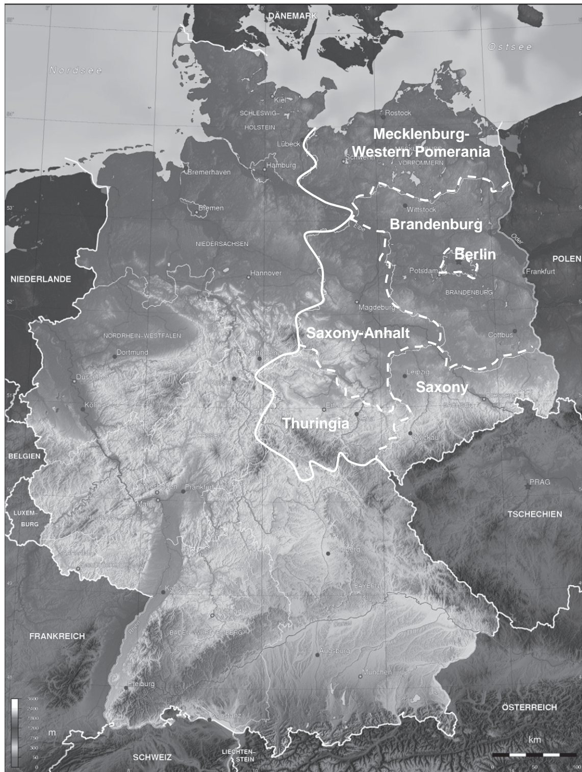
Fig. 1. Topographic map of Germany with the six East German states.

Source: accessed via Wikimedia commons: Permission is granted to copy, distribute and/or modify this map under the terms of the GNU Free Documentation License, Version 1.2 or any later version published by the Free Software Foundation; Modified as follows by the authors: The white solid line mirrors the former border between the GDR (East Germany) and the FRG (West Germany) before the reunification in 1990. The white dashed lines show the borders of the East German states which were newly implemented after the reunification in 1990.