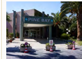
Pine Bay Resort, main entrance

Participation in the conference and conference materials, Conference dinner on 7 October 2015, including Turkish music, Six nights in a single room from 4 until 10 October 2015 at the Pine Bay Resort, Meals are all inclusive for the whole stay, Free bus transfer on 4 October 2015 from the airport in Izmir to Kusadasi and return 10 October 2015.