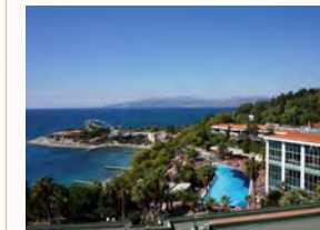
View from Pine Bay Resort

Participation in the conference and conference materials, Conference dinner on 7 October 2015, including Turkish music, Three nights in a single room from 5 until 8 October 2015 at the Pine Bay Hotel, Meals are all inclusive for the whole stay.