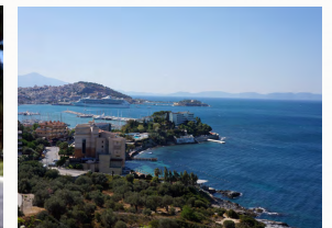
Panorama of Kusadasi