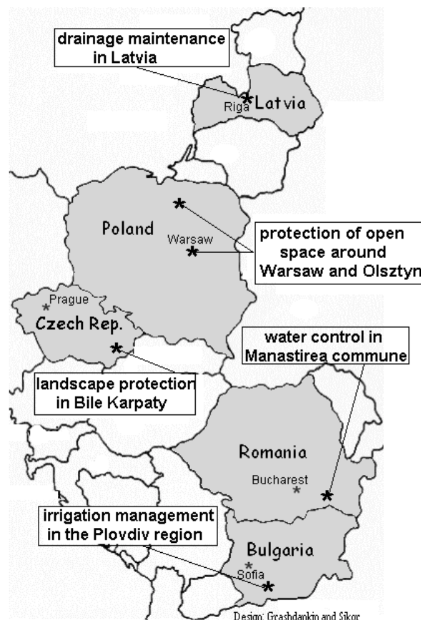
Figure 2: The case studies in Central and Eastern Europe

The current situation is radically different from that under socialist agriculture. Large state farms and co-operatives dominated agricultural production in the case study sites, with the exception of the Polish sites. Large state bureaucracies were the tools for a strongly hierarchical approach to natural resource management, combined with some elements of local-level co-operation in water management. Technical agencies were responsible for the provision of water, construction and maintenance of irrigation and drainage infrastructure, soil conservation programs, urban and regional planning, and the protection of biodiversity. Postsocialist reforms radically altered the institutional framework for the management of common-pool resources as well as rural actor constellations. How agrarian transformations affected the management and state of common-pool resources is the topic of the ensuing analysis.