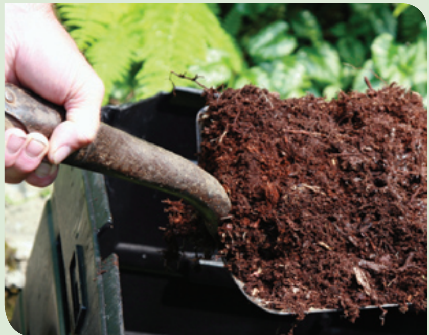
Turning garden and kitchen waste into compost reduces heat-trapping methane emissions from landfills, improves your garden’s soil, and helps it store carbon.

To read more about the science of composting and tips for choosing a system appropriate for your yard, visit the University of Illinois Extension website ( http://web.extension.illinois.edu/homecompost/intro.html ).