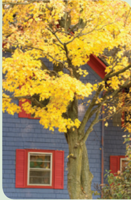
Well-placed trees can help homeowners save energy by shading their homes.

More information about tree care and the benefits of planting trees is available on the Arbor Day Foundation website ( http://www.arborday.org ).